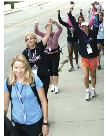
2009 Weekend to End Breast Cancer participants kept the enthusiasm going as they walked 38 miles to raise money for breast cancer programs at St.Vincent.