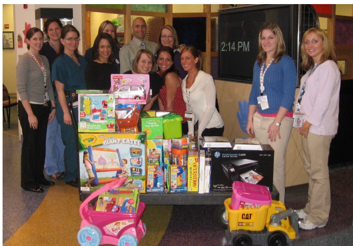
Associates from St. Vincent Pharmacy purchased toys, tvs, cameras, and other gifts for kids at Peyton Manning Children's Hospital following their annual fundraiser.