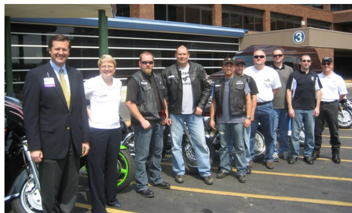
Iron Knights Motorcycle Club held their second annual charity ride to benefit Peyton Manning Children's Hospital.

Accelero Health Partners Advantage Health Solutions, Inc. American Family Insurance Baldwin & Lyons, Inc. The Bank of New York Mellon Bill Estes Automotive Brigham Family Foundation Burks Family Foundation, Inc. Cancer Care Group, P.C.