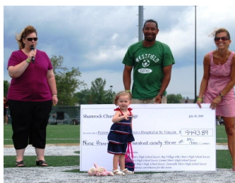
The Westfield High School Soccer team hosted their second annual charity soccer tournament to benefit the patients at Peyton Manning Children's Hospital.