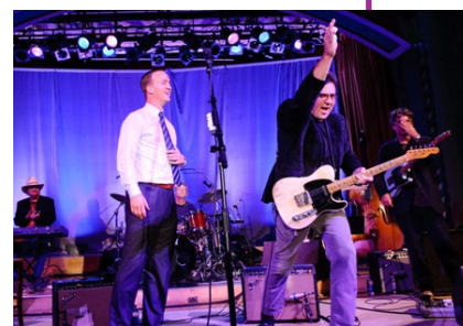
Country music artist Vince Gill provided musical entertainment at the 2010 Peyton Manning Children's Hospital at St. Vincent Celebration of Caring gala. The gala raises money for the Supportive Care Team.