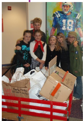
One local Girl Scout troop donated toys for Peyton Manning Children's Hospital during Trick or Treat for Kids off Their Feet.

As I reflect on the past fiscal year, I am very grateful. The spirit of caring for which St. Vincent is noted is apparent at every meeting I attend, every patient I visit and every event that is undertaken. In many ways it is remarkable and wonderful that an organization has not changed its mission or its focus in nearly 130 years – serving the sick and the poor with a spirit of caring.