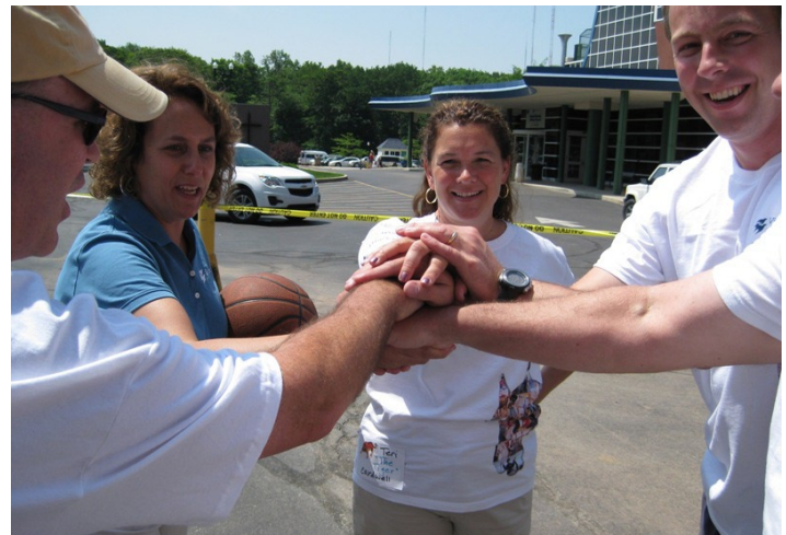
Associates and Hospital Administration competed in a HORSE basketball tournament to raise funds for the 2010 Associates Campaign.