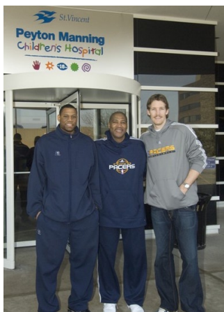
Members of the Indiana Pacers visited the children at Peyton Manning Children's Hospital. They brought posters and signed basketballs to hand out to the kids.