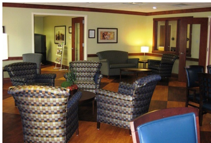
In June 2010, the renovation of St. Vincent Hospice was completed. The facility was blessed at a grand opening attended by Hospice donors and associates.