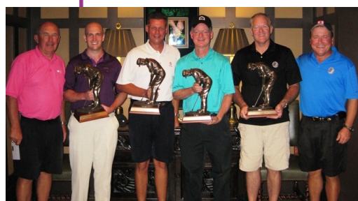
The 2009 St. Vincent New Hope Golf Outing foursome from Bradley & Associates, Inc. took first place. The outing raises money to support services for individuals with developmental disabilities and abused and neglected children.

Thank you for your continued support of St. Vincent. Our combined efforts, gifts and talents have created a successful year!